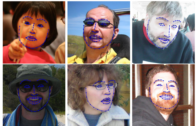
Figure 1: The Menpo Project provides all the tools necessary to perform facial point localisation.

Permission to make digital or hard copies of all or part of this work for personal or classroom use is granted without fee provided that copies are not made or distributed for profit or commercial advantage and that copies bear this notice and the full citation on the first page. Copyrights for components of this work owned by others than the author(s) must be honored. Abstracting with credit is permitted. To copy otherwise, or republish, to post on servers or to redistribute to lists, requires prior specific permission and/or a fee. Request permissions from Permissions@acm.org . MM '14 November 03 - 07 2014, Orlando, FL, USA Copyright 2014 ACM 978-1-4503-3063-3/14/11 ...$15.00 http://dx.doi.org/10.1145/2647868.2654890